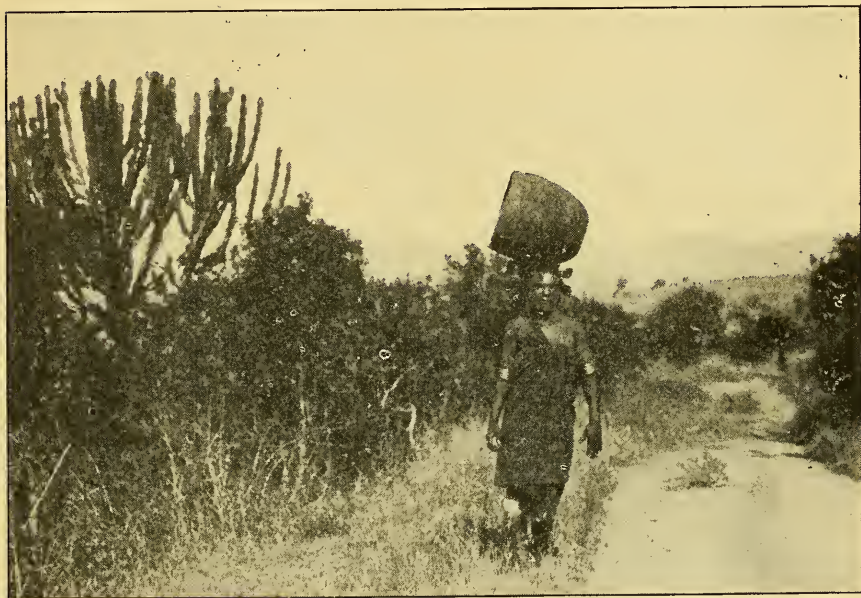
IN BROWNIE'S COUNTRY

followed her, remembered the prophesy about staying the strange white thing, so he started and ran after her. She made him help her Bearers unpack her load. She handed him a teakettle, and her husband an oil heater. She, herself, led the way back. Her eyes blazed at the silly witch doctor, and with her gestures she commanded the chief to end his